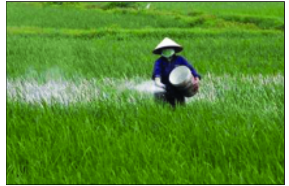
A farmer in Vietnam spreads fertilizer. With food prices sky-rocketing, so have prices of fertilizers.

Tomlinson Bomberger is taking proactive measures to deal with the increasing fertilizer costs, including more comparison shopping, bulk purchasing and early warehousing of materials. However, if prices do not soon stabilize or reverse, costs for lawn, tree and shrub fertilizations may need to be adjusted as spring approaches. We will continue to actively monitor this situation and share pertinent information with our clients. 🌲